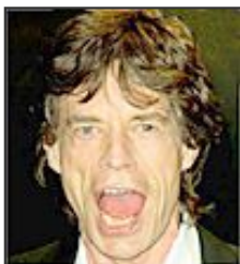
Mick Jagger is one of many celebrity dads who has chosen to have children later in life