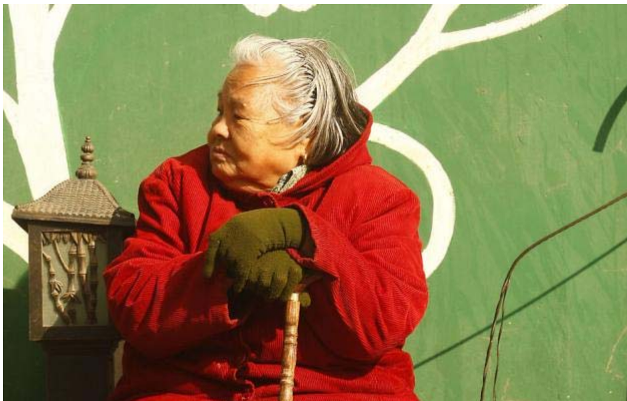
An elderly Chinese woman sits in the midday sun in downtown Beijing March 11, 2011.